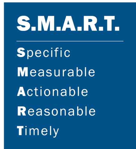
Figure 4: S.M.A.R.T. Objectives

Once the goals, objectives and tasks for accomplishment have been identified, the planning team should prioritize them and develop a schedule by those that require short-term action and those that may require long-term planning.