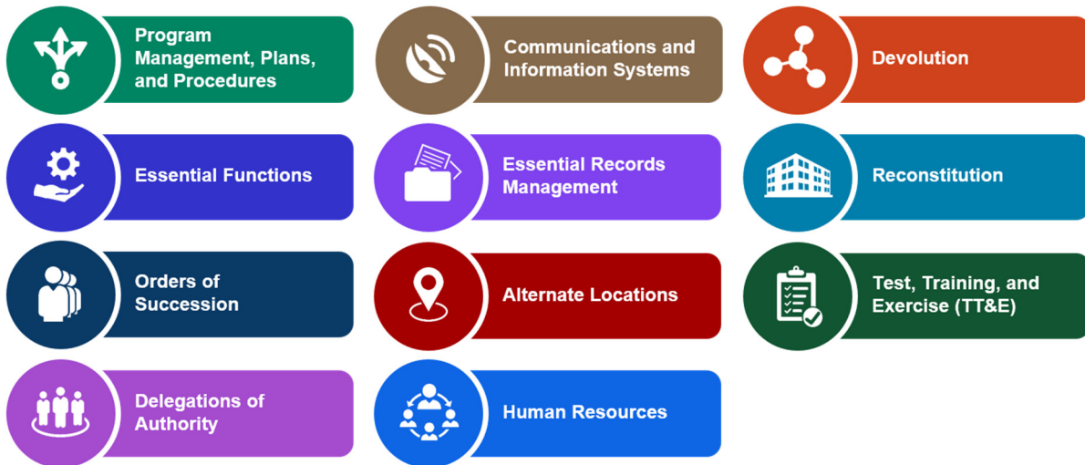
Figure 2: Continuity Mitigation Options and Key Elements

The purpose of the MYSP is to set the overall goals and objectives for your continuity program. Organizations should develop a continuity focused MYSP that provides for the development, maintenance and review of continuity programs and plans to ensure the program remains viable and successful. When developing the MYSP, the planning team should account for the mitigation options and key elements of a viable continuity capability (refer to Figure 3 and the CGC for full descriptions).