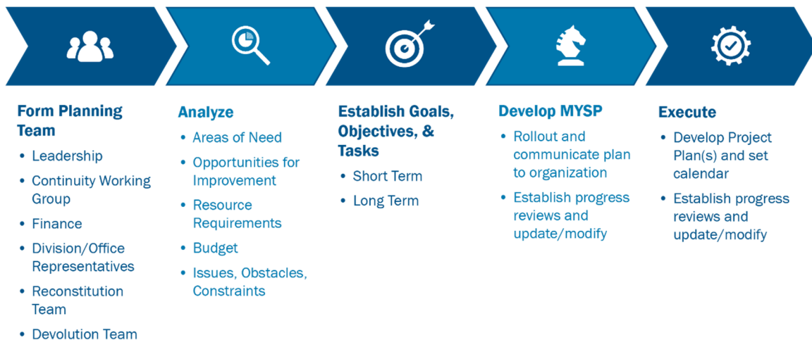
Figure 3: MYSP Development Process

A MYSP with short and long-term goals and objectives serves as a framework for making decisions and provides a basis for planning. Putting together a strategic plan can provide the insight needed to keep an organization’s continuity program on track by setting goals and measuring accomplishments. By analyzing the information in the strategic plan, leadership and continuity planners can make necessary changes and set the stage for further project planning.