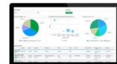
POD Inventory Management Tool