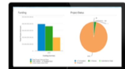
Cost Reimbursement Management Tool