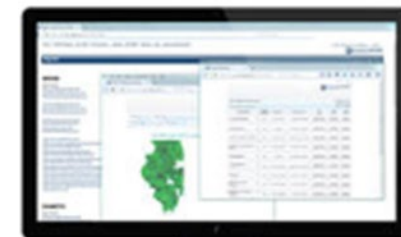
Customized Analytics & Reporting