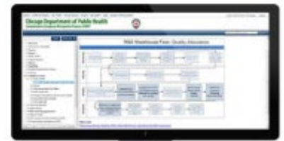
Remote Work Management Platform