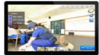
Virtual Training & Exercises