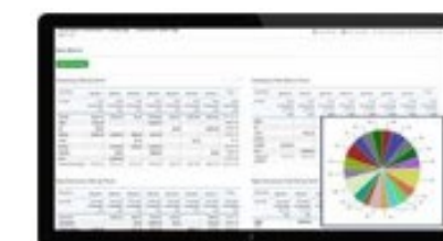
POD Prophylaxis Reporting Tool