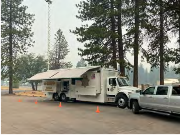
The Mobile Command unit from Plumas County Sheriff's Office