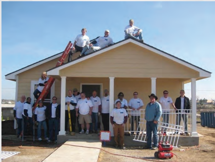
A group of volunteers, including a number of former and current ISC team members, offered their assistance in Joplin, MO, as the community began recovery efforts after the May 2011 tornado.

You can check local organizations to find out how you can offer your assistance, such as the Red Cross, Salvation Army, local churches, Office of Emergency Services, Habitat for Humanity, Evacuation Shelters, Food Banks, Homeless Shelters, etc.