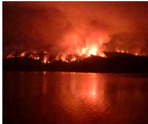
Bucks Lake CA, Dixie Fire backburn, 7/24/21-7/25/21