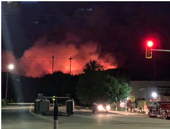
Dixie Fire as it approaches Quincy CA from Highway 70 and Chandler Road area 7/23/21

Plumas County is receiving mutual aid support from 105 law enforcement personnel from Northern California, the Bay Area, and Nevada. They will staff road closures, patrol evacuated areas, and assist with operations, planning, and logistics for the county.