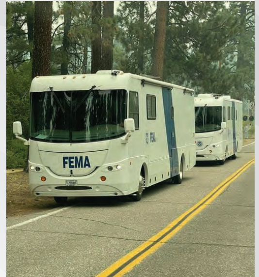
FEMA Mobile Units arrive in Graeagle, CA 7/26/21.

The ISC Team is standing by to assist in any capacity possible.